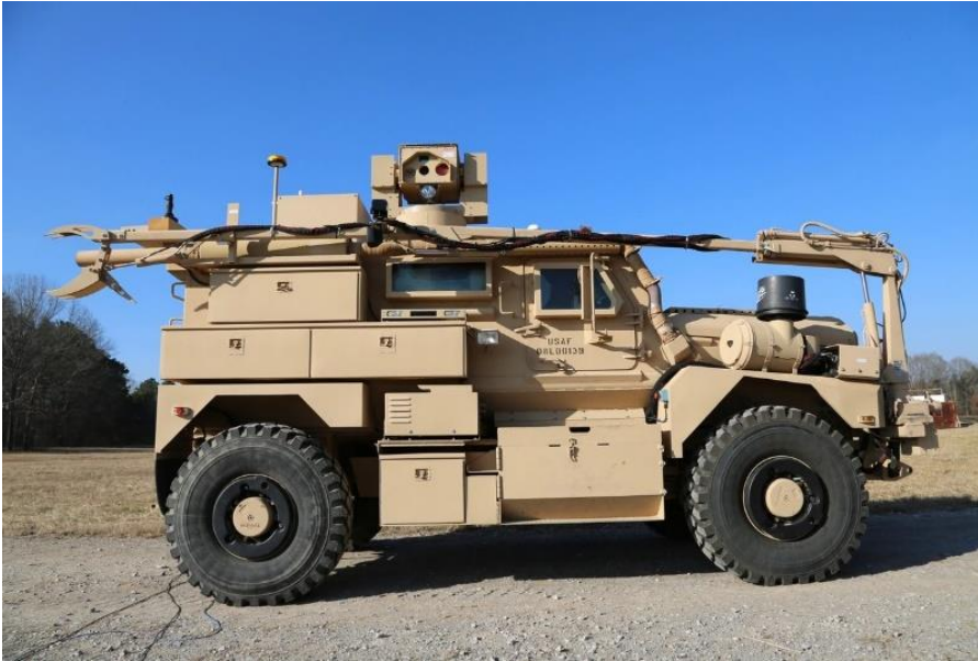
Redstone Test Center

Craig Bowman War History Online Oct 20, 2020