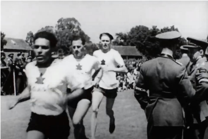
Members of the Royal Canadian Army Service Corps participate in a one-mile race as part of a wider I Canadian Corps sports meet in the United Kingdom, 1943 (Canadian Army Newsreel No. 12).