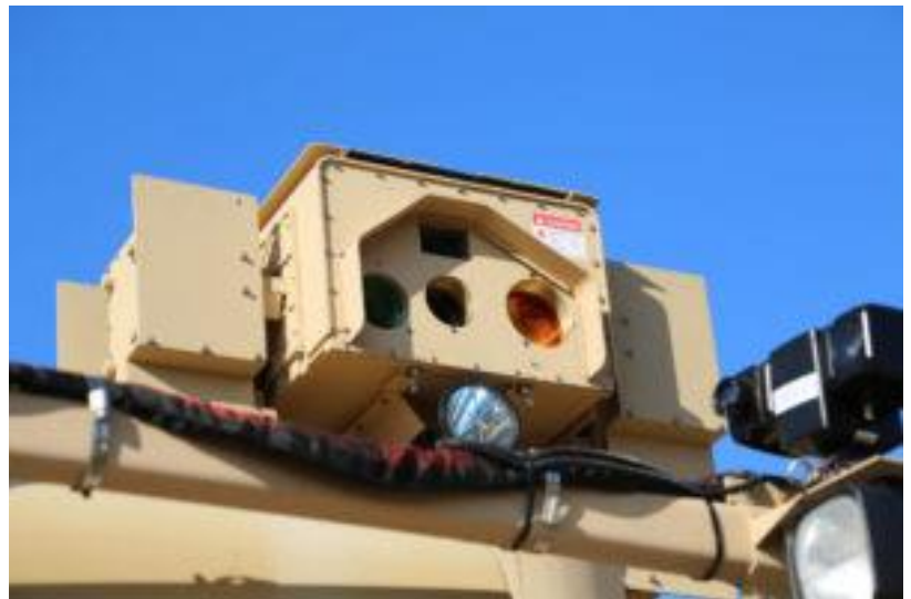
The ZEUS Laser System mounted on top of the vehicle.

The US Air Force is working with a company based in Virginia, Parsons Corporation, to build a vehicle that will have the capability to detonate landmines from just under 1000 feet